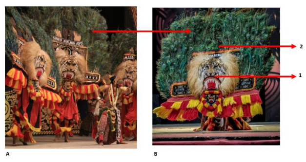
A:Singobarong sebagai raja hutan saat melawan Klanasewandono. B1 Harimau, B2 Burung merak

Figure Singobarong In performing arts, Reog Ponorogo is interpreted as the king of the forest, known as Singabarong. Figure singobarong represents the meaning of toughness, courage, and greatness of a ruler in a kingdom.BaronganThis is an important component in the performing artsReogwhich depicts a King Singabarongruler of the Lodaya Kingdom who was famous for his extraordinary toughness and supernatural powers.