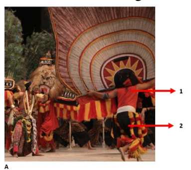
A:Singobarong saat melakkan tari merak nothal terwujud dengan gerakan ngebat-ngebat AI Kaos <u>berwama merah tanpa</u> lengan simbol bahwa pembarong memiliki sifat pemberani, A2 Celana gombyog wama kuning dan merah atau rumbairumbai wama merah dan kuning.

Figure Barong Lion, also represents a symbol of two contrasting characters, namely the tiger and the peacock. Tigers have strong physical strength and are known as the king of the jungle. Therefore, he was highly respected among the wilderness residents. Meanwhile, peacocks are a symbol of beauty, and grace and have a strong attraction to other animals.