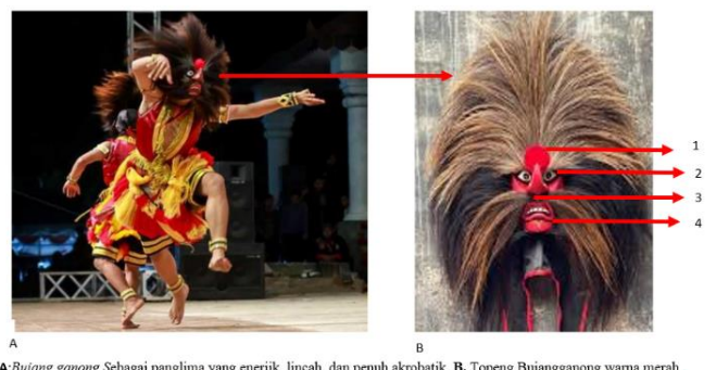
A:Bujang ganong Sebagai panglima yang enerjik, lincah, dan penuh akrobatik. B. Topeng Bujangganong warna merah B1 Manik-manik B2. Mata <u>Melotot</u>, B3 Hidung mancung, B4 <u>Mulut</u> terlihat gigi berseri, bukan bertaring

A young poet often referred to as single guys the object of study interpreted as the warlord of the Bantarangin Kingdom. Single in Indonesian it is a symbol of a young, unmarried man, whereas Like that means young. So Bujang Ganong in performing arts is defined as a young male character energetic. Single guy represents an energetic, agile and acrobatic commander who substantially contains noble values as a patih who is full of dedication and responsibility in arranging kingdom management strategies. The play Bujang Ganong in Ponorogo's reog performing arts is performed with dance movements that reflect a deft, acrobatic attitude that attracts a lot of public attention.